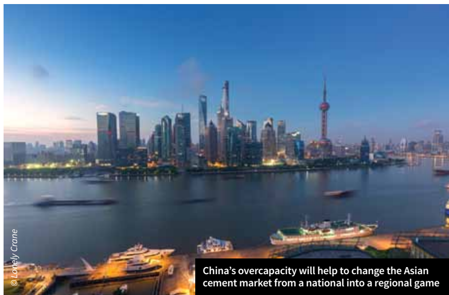
China's overcapacity will help to change the Asian cement market from a national into a regional game

The word “China” instills a sense of fear in many Asian cement producers. The current state of the world steel market exemplifies what can happen to a global commodity if there is overcapacity in China. Estimates of actual capacity in China are surprisingly hard to obtain, but are around 3.16bnta, according to The Global Cement Report. To put this into perspective, the rest of Asia Pacific cement production is roughly 600-700 Mta. Irrespective of the actual size, low capacity utilisation in China (60-65 per cent in 2015), combined with